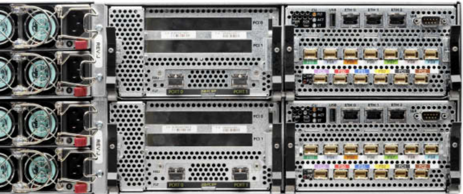
Rear View of Pillar's Slammer Storage Controller