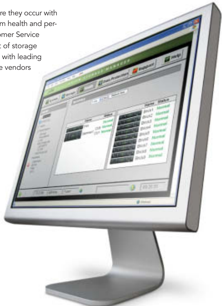
Storage Manager Software